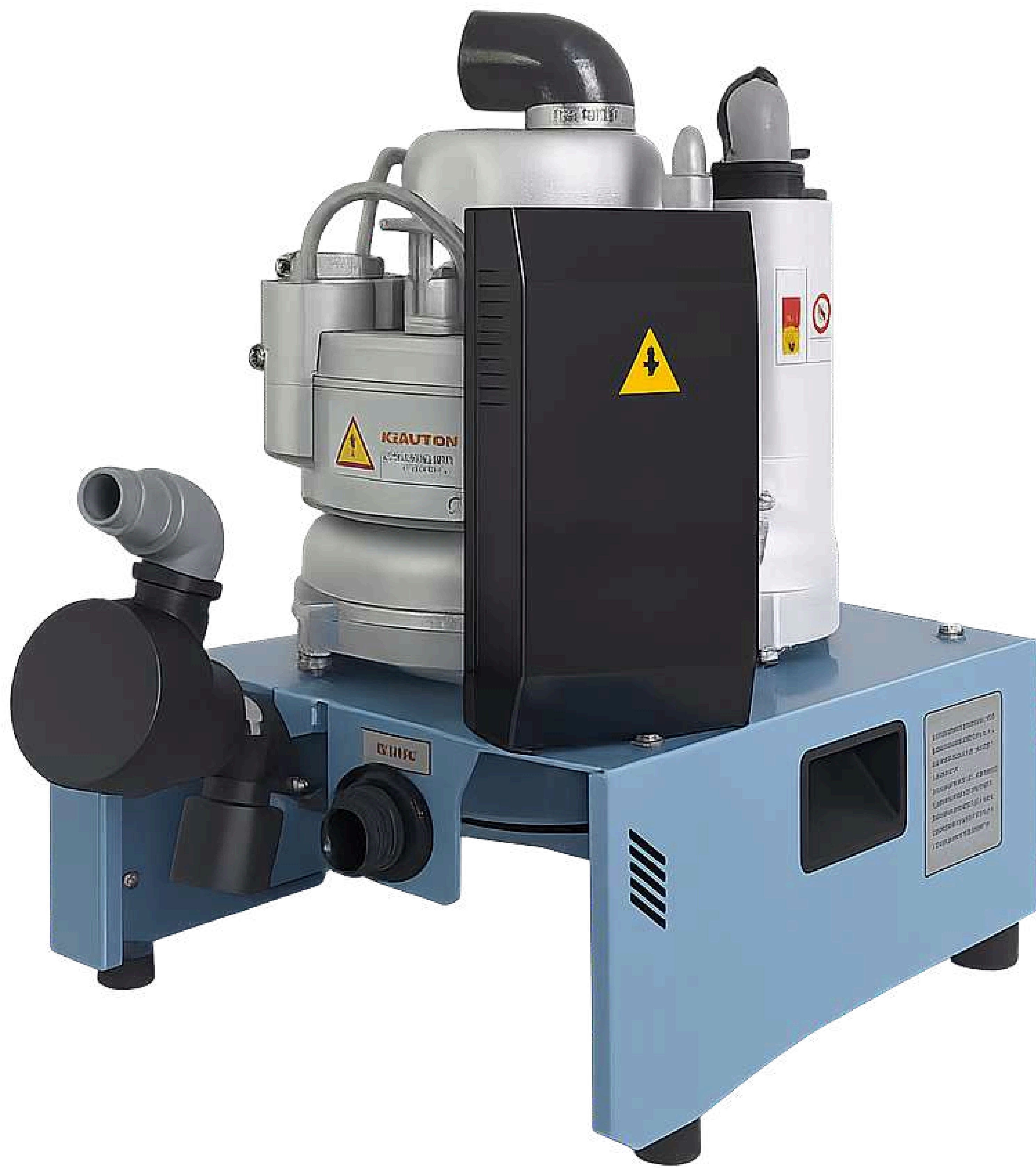
DIRECT - SEMI WET