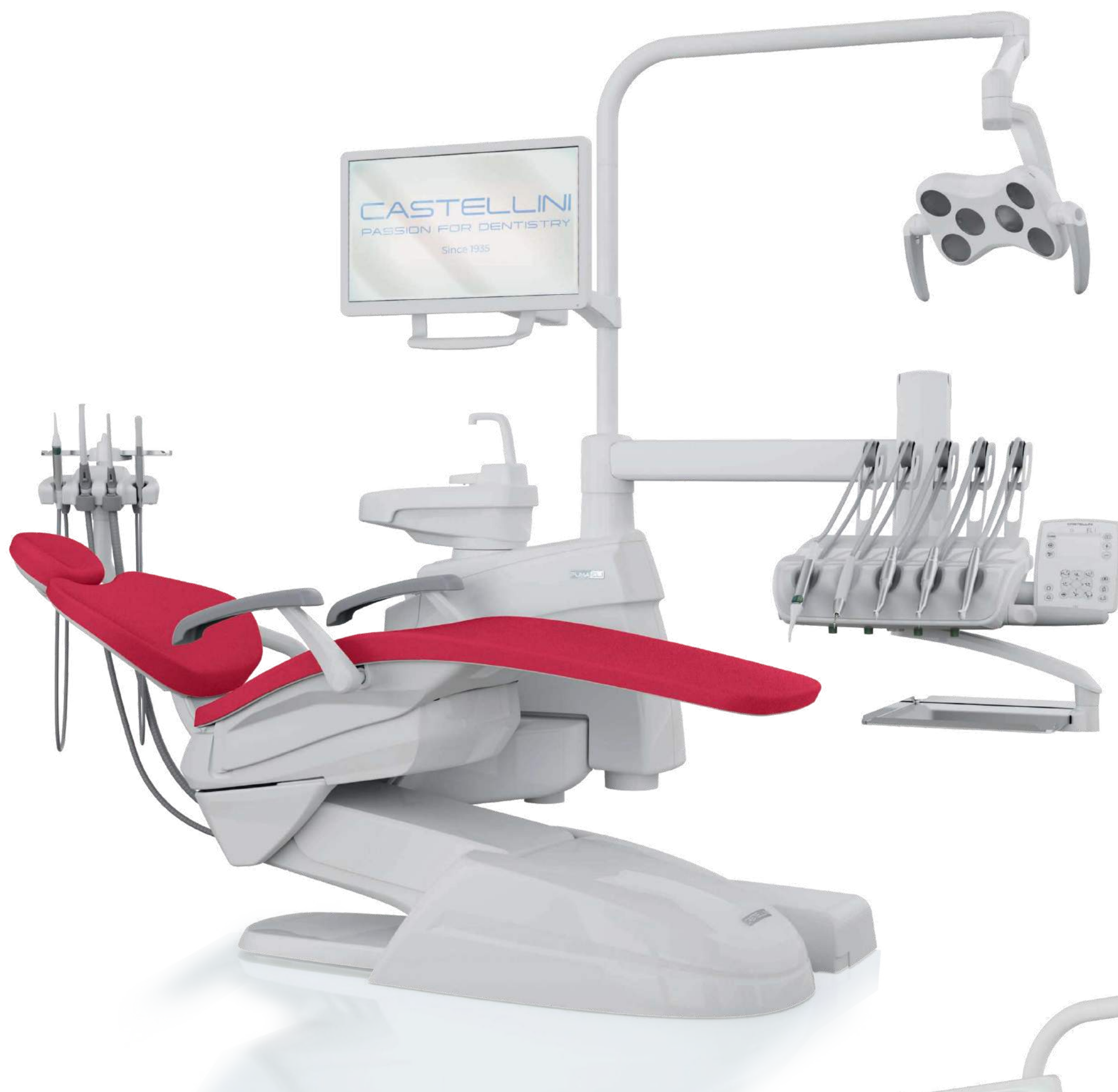
PUMA ELI R